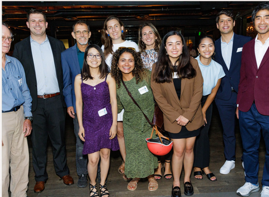
CAW's "Extended Family" 2022

Conserving Resources. Preventing Pollution. Protecting the Environment.